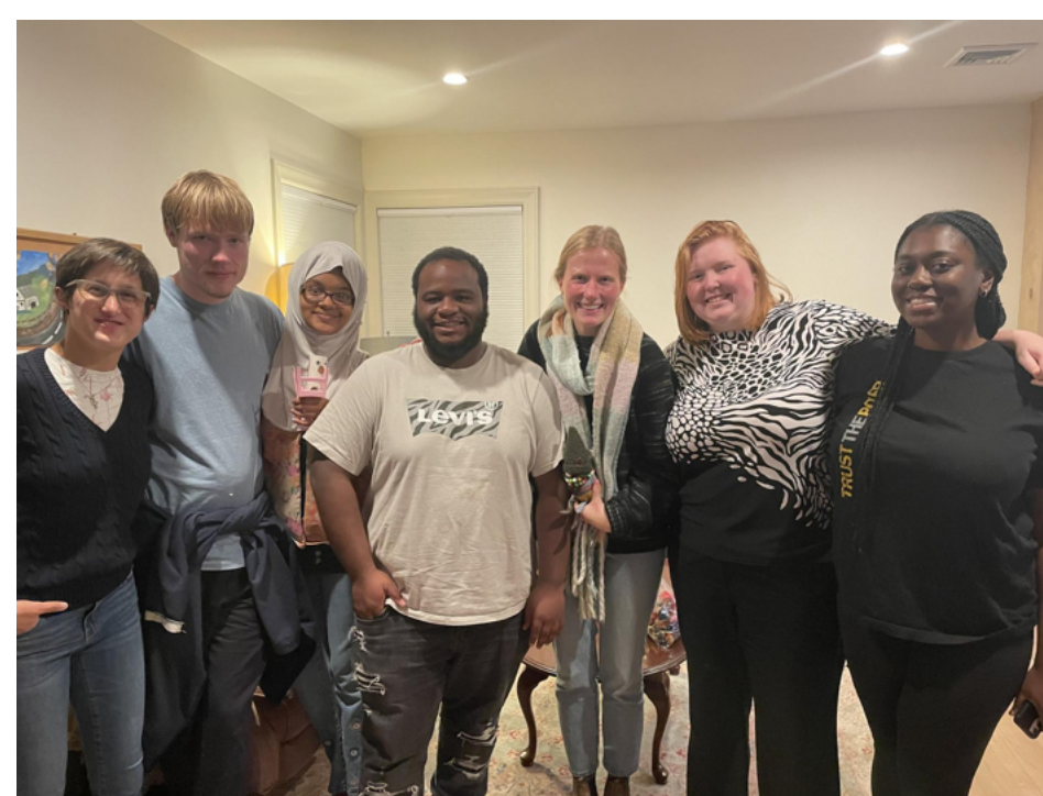
Hosting Reality Ministries for a Vocational Discernment Dinner