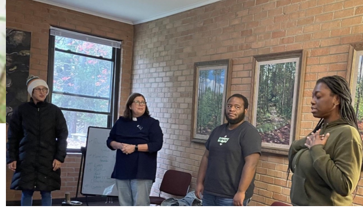
Retreat at Avila Center