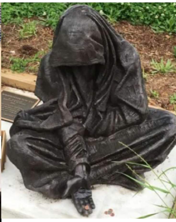
Fellows served breakfast at St. Joseph's Episcopal Church