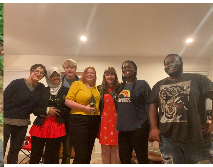
Discernment dinner with Habitat!