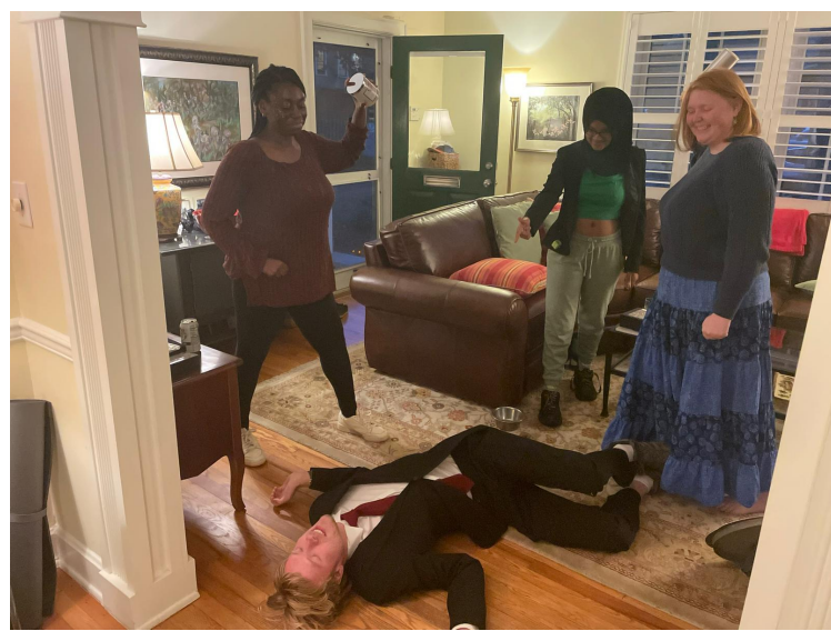
Halloween Party at Day Smith Pritchett's